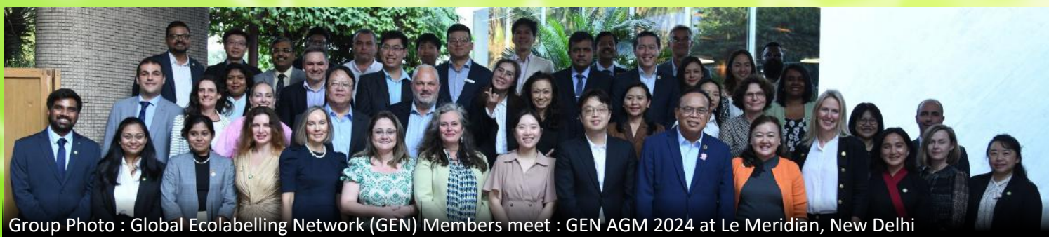
Group Photo : Global Ecolabelling Network (GEN) Members meet : GEN AGM 2024 at Le Meridian, New Delhi