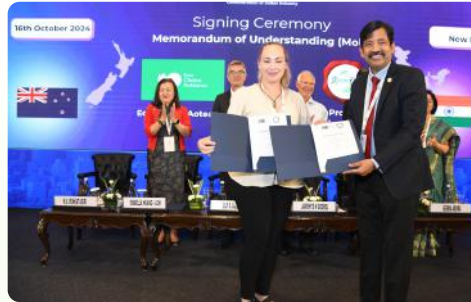
GreenPro & Eco Choice Aotearoa MOU - India and New Zealand EcoLabel