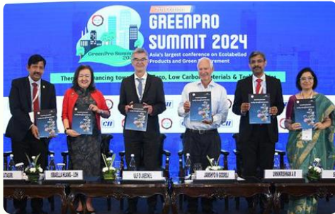
Launch of Framework GreenPro for Facility Services