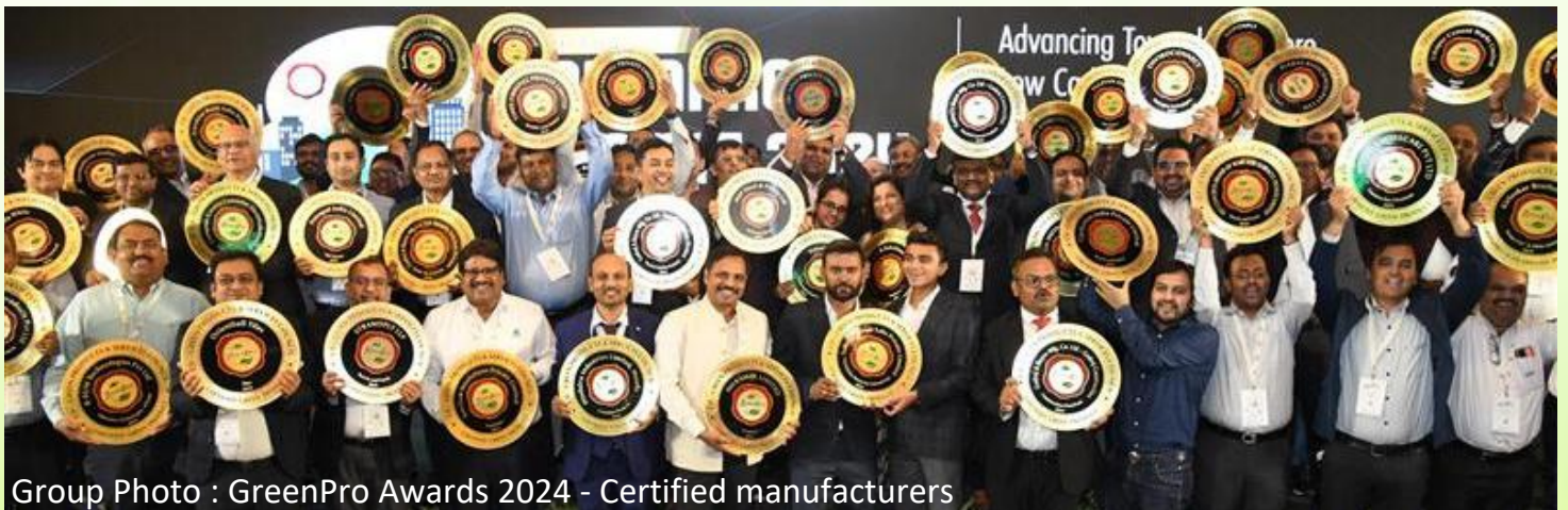
Group Photo : GreenPro Awards 2024 - Certified manufacturers