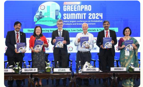
Launch 5th Edition - GreenPro Directory